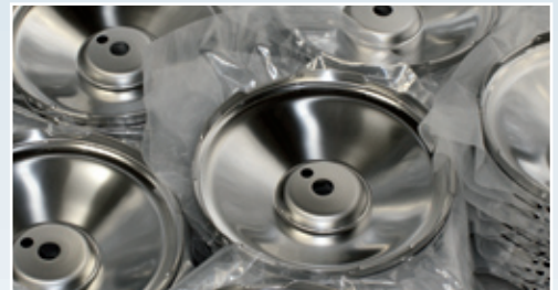
HILDEBRAND A-1476 WASHING PLANT Energy consumption over 24 hours